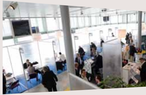
Windustry France Business meetings, 2013 - Le Havre, France.