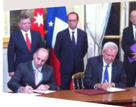
Agreement SER and EDAMA (Jordan RE association).