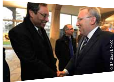
Meeting at annual conference SER of M. AMARA, Minister of Energy, Mines, Water and Environment, Marocco and M. Hasan Murat MERCAN, Deputy minister of Energy and Natural Resources, Turkey.